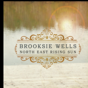
Silver Spoon North East Rising Sun