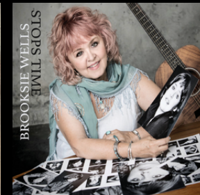
Tend the Nets Stops Time